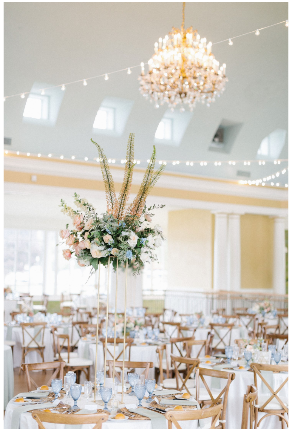
The Riviera Ballroom