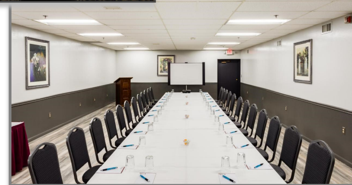
Harbor Shores Pelican Bay