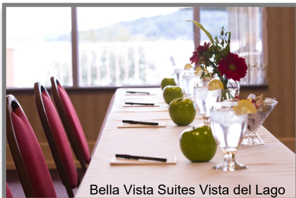
Bella Vista Suites Vista del Lago