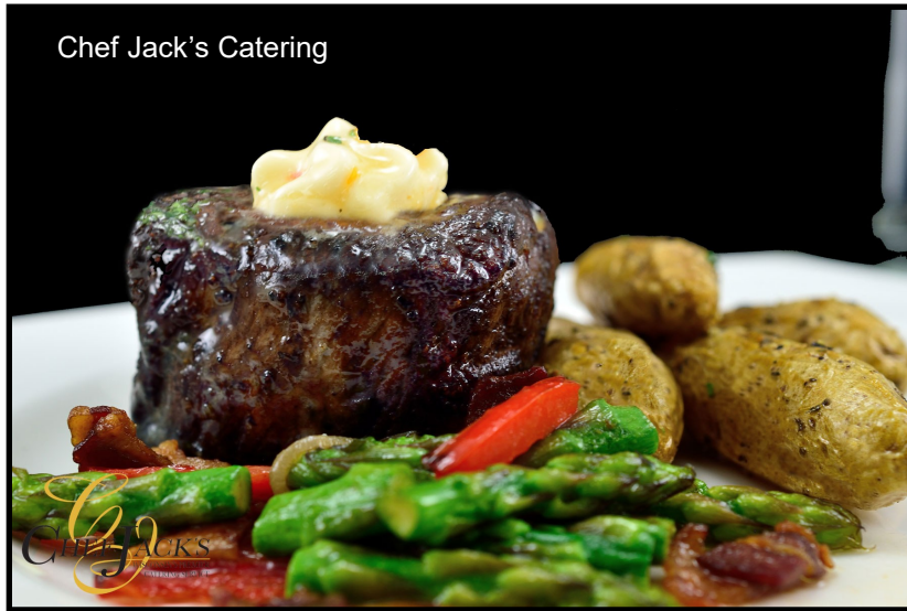
Chef Jack's Catering

The Caterer is to be chosen from this list for all events.