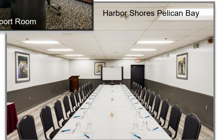
Harbor Shores Pelican Bay