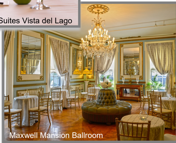
Maxwell Mansion Ballroom