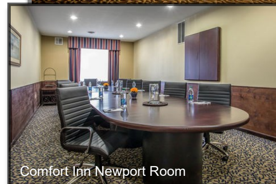
Comfort Inn Newport Room